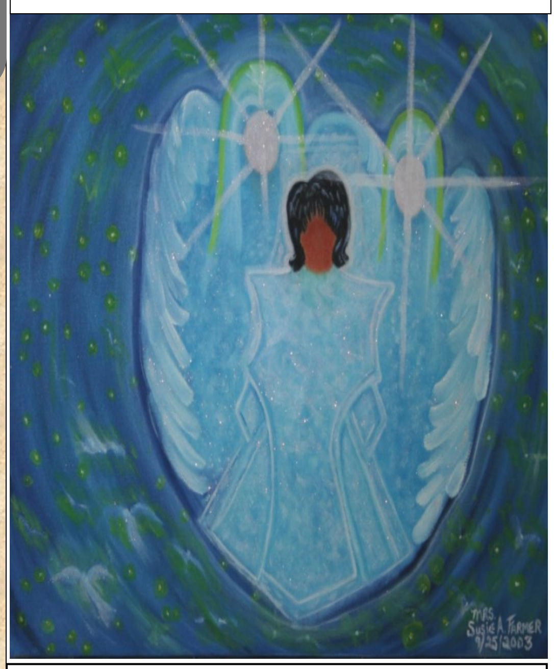
Lc 20:36 They can no longer die, for they are like angels; and they are the children of God because they are the ones who will rise.